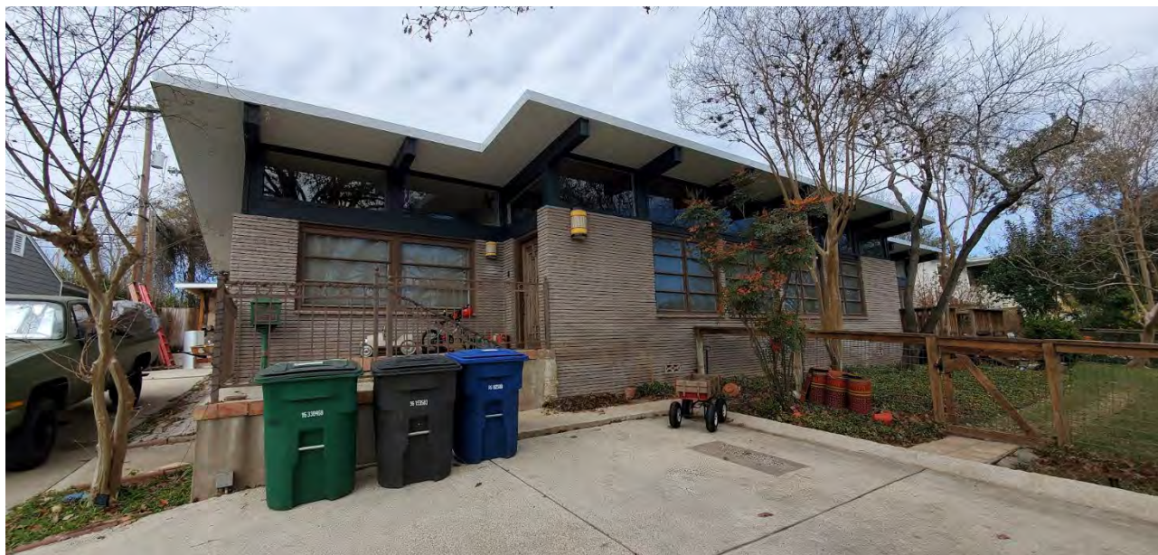
Southwest oblique, showing main entry