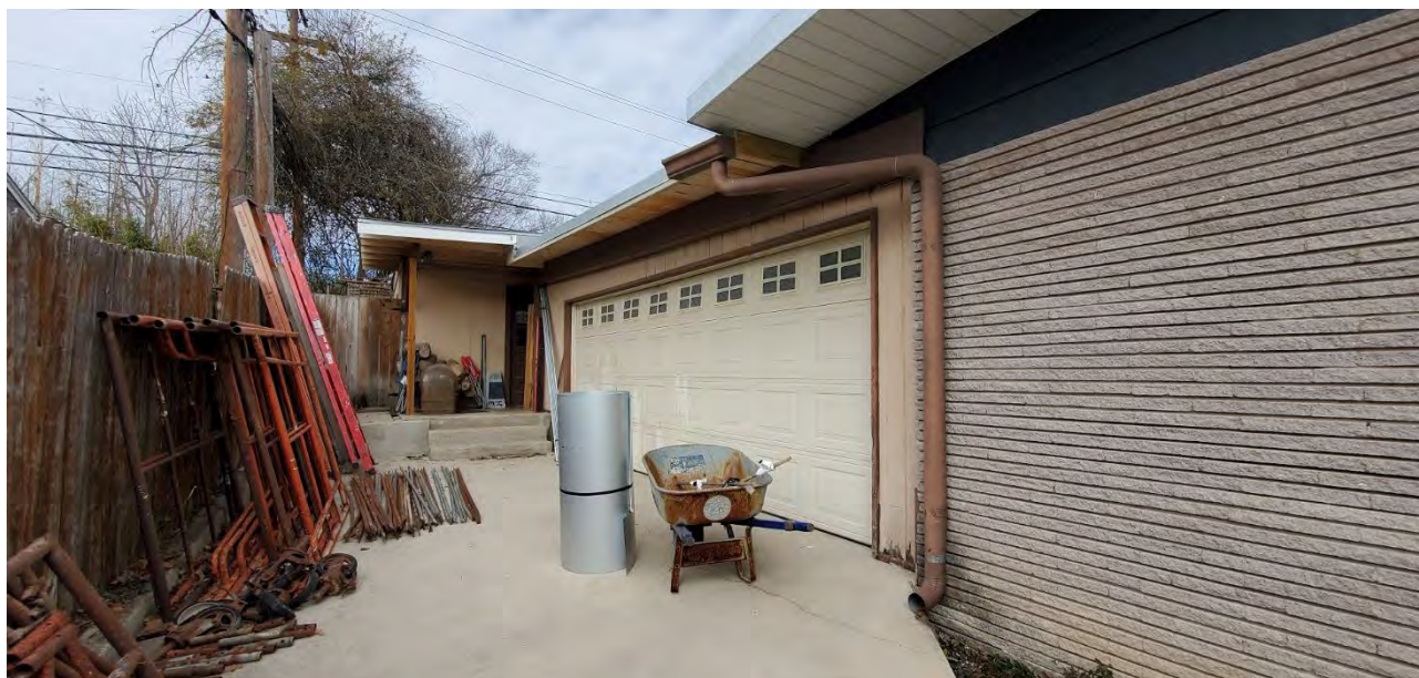
West elevation, showing garage and entrance to rear casita