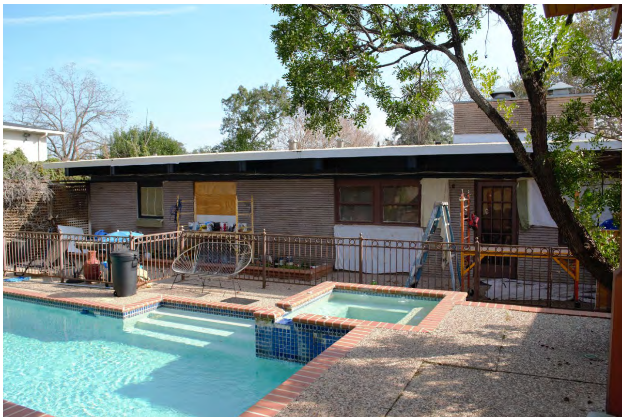
North/rear elevation